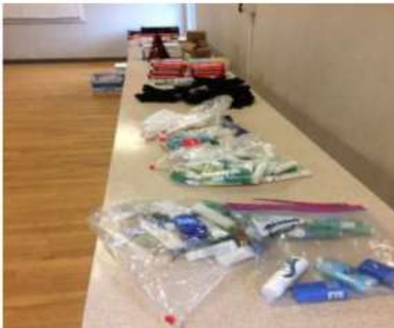
Another table of snacks and personal items to fill the bags.