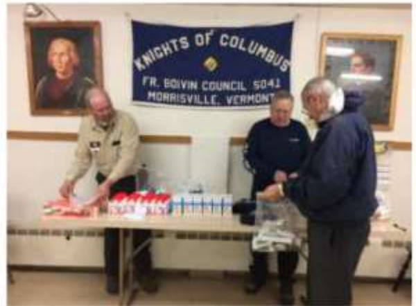
Members filled 20 bags with the collected items.